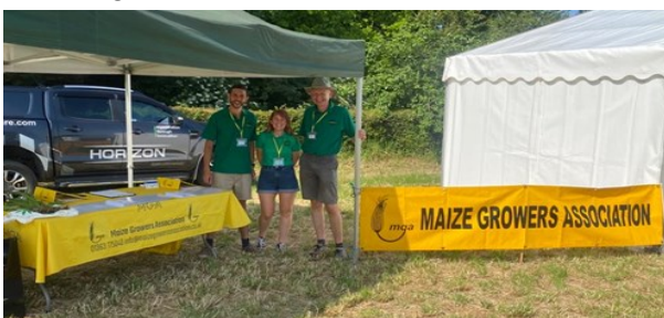
MGA stand at Moley Innovation Day June 2023