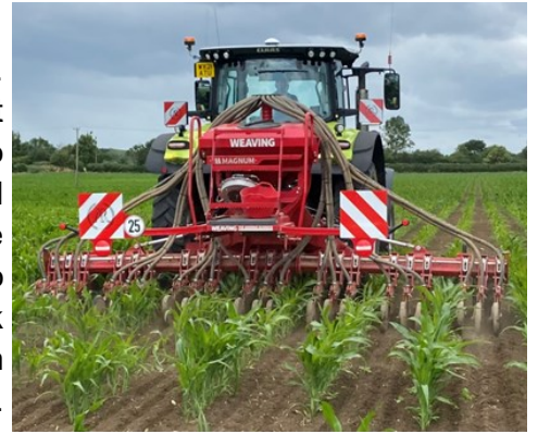
Undersowing at SW MGA site July 2023

Those keen to learn more about the trials, including starter options, foliar nitrogen, under sowing and more can join the MGA team for an open evening on Wednesday 26th July.