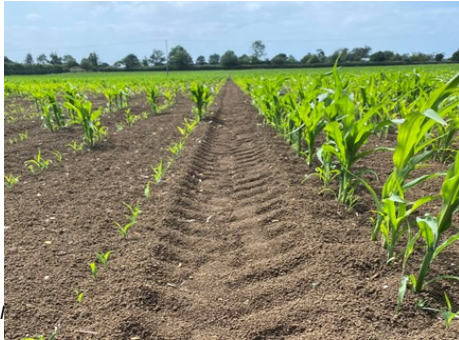
Impact of drilling depth in a dry spring

At the South West trial site maize was drilled late, due to the wet spring. Although the crop is still a little behind it is starting to progress now that it has some much-needed rain. We would like to take this opportunity to thank the companies sponsoring the MGA SW trial site. QLF, Natural England and Wessex Water whose contributions made the SW trial site possible this year. Thanks also to Steanbow Farms for practical work on the ground and Green Farm Seeds for Undersowing seeds. Thanks also for product from the foliar nitrogen (Efficient 28 & PolyN) and phosphate (Yara), suppliers.