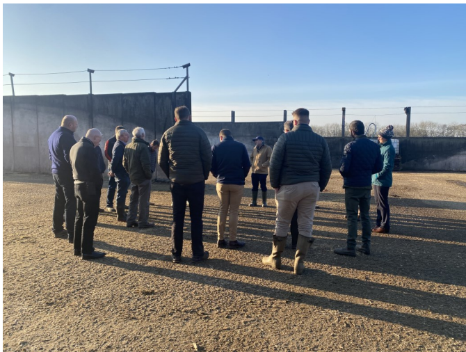
Attendees at CEDAR farm tour