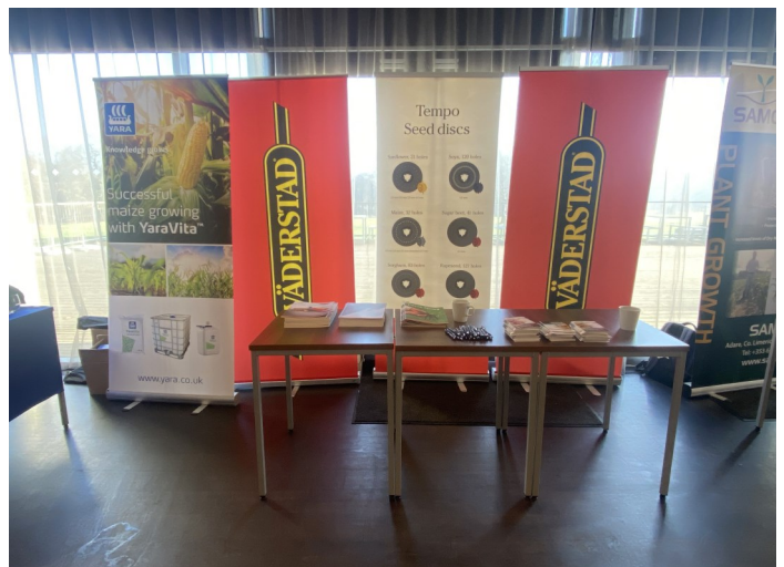
Vaderstad trade stand