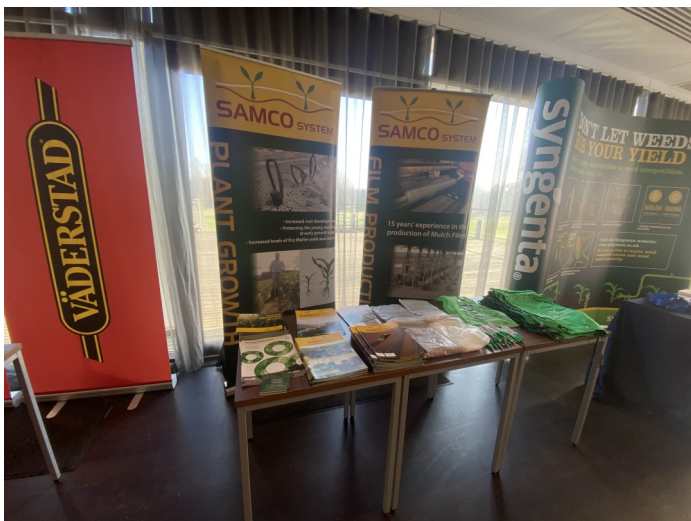
SAMCO System Trade stand