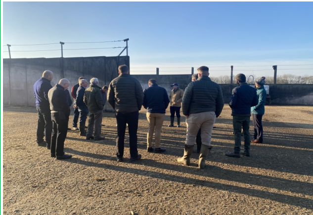
Picture taken at CEDAR. MGA conference 2023

Tickets for the conference are available via Eventbrite using the following link or QR Code.