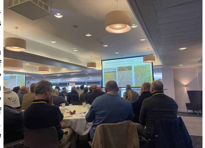
Picture taken at the MGA Conference 2023

The 2024 conference will be held at Eastwood Hall in Nottingham on the 28th February to include a host of excellent speakers and a chance to network with industry leaders while looking around a variety of trade stands. In an exciting change we are having our farm visits the day before on the Tuesday 27th. These visits include a tour of Severn Trent's AD site and a trip to a local dairy farm. Spreading our event over two days gives us more opportunity to showcase more of what the MGA does.