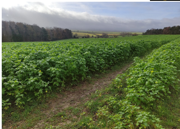
2021 winner, John Ford, drilled his mustard into wheat stubble in September. John's picture was taken in December with the mustard

With this application form, we are delighted to launch the 2022 photo competition for the best cover or undersown crop picture, and story, of a field destined for maize in 2023. Establishing cover crops, be they post or pre harvest, has been a challenge this summer due to the extreme heat and drought conditions. The recent autumn rain was just what was needed. We very much look forward to learning of how crops have developed.