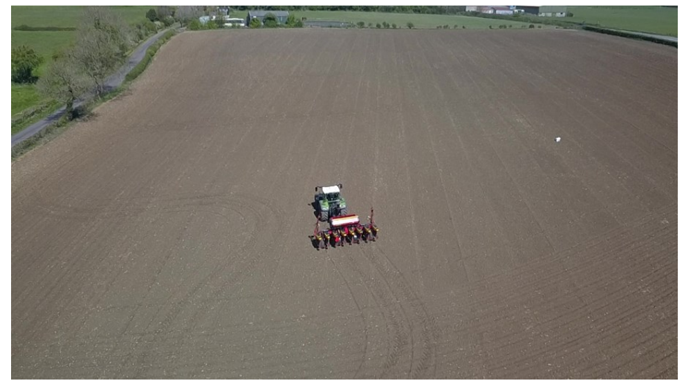
Ready Steady Go! for the drilling of the SW MGA/ Wessex Water Trial Site

The site was drilled on Monday 20th April with nitrogen applied two days later. Top dressing with more nitrogen and Boost, plus the undersowing, will take place when the time is right.