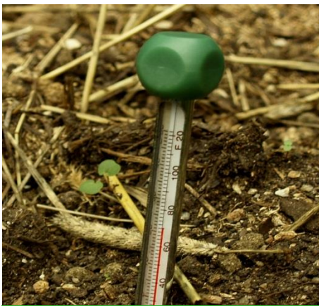
Fig 1 Thermometer measuring soil temperature at sowing depth

What is the impact of drilling date on crop harvest date? - The MGA with the support of Catchment Sensitive Farming (CSF) established a demonstration site at Metcombe, Tipton St John in East Devon in 2010. The performance and maturity of maize drilled one month apart was compared.