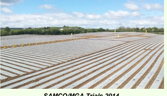
SAMCO/MGA Trials 2014

The yield data and analysis will now be combined to generate the complete picture of how the varieties performed. this (or to be more precise the new variety book to be posted out in December) space for the first glimpse of the MGA Maize under film results.