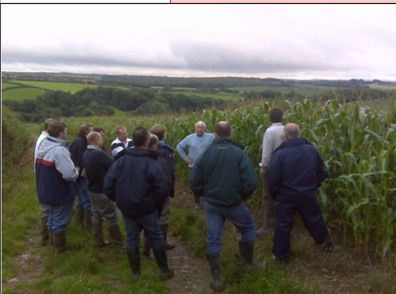
MGA Meeting in Tamar Valley 2009

Tuesday 20th September sees the first of a series of winter maize meetings. The Profitable Marginal Maize Meeting will be held in Clawton, nr Holsworthy and will focus on Maize Eyespot ( a real issues in this area) as well as marginal maize growing agronomy and maize under plastic. This event will also include an update on the planned Environment Agency crackdown in the Tamar Valley on environmental issues.