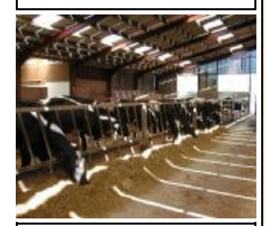
Cows back on winter rations - 11th July 2007.