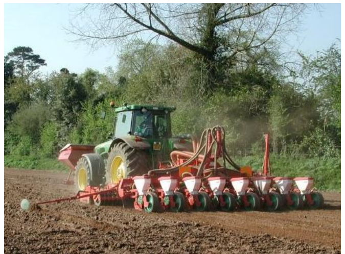
Fig 1 Drilling maize plots with starter fertiliser at the Exe Valley CSF demo site nr Exeter

In certain, usually low soil index fields, the use of starter fertiliser has been shown to boost crop yield and advance crop maturity as a result of more rapid early establishment however in many fields starter fertiliser has little or no impact and the only consequence of applying starter fertiliser is to build soil phosphate reserves. If this high phosphate soil leaves the field via surface runoff, phosphate can enter watercourse and cause environmental problems.